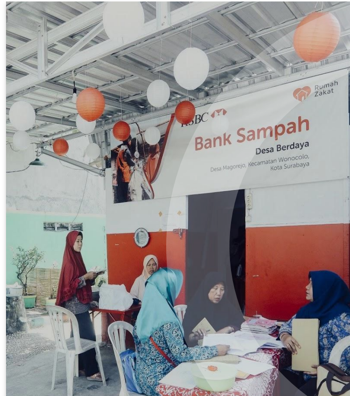
OPPA partnered with ITS Surabaya and Bank Sampah Induk Surabaya to create an open-source map of all Waste Banks operating in Surabaya, Indonesia.