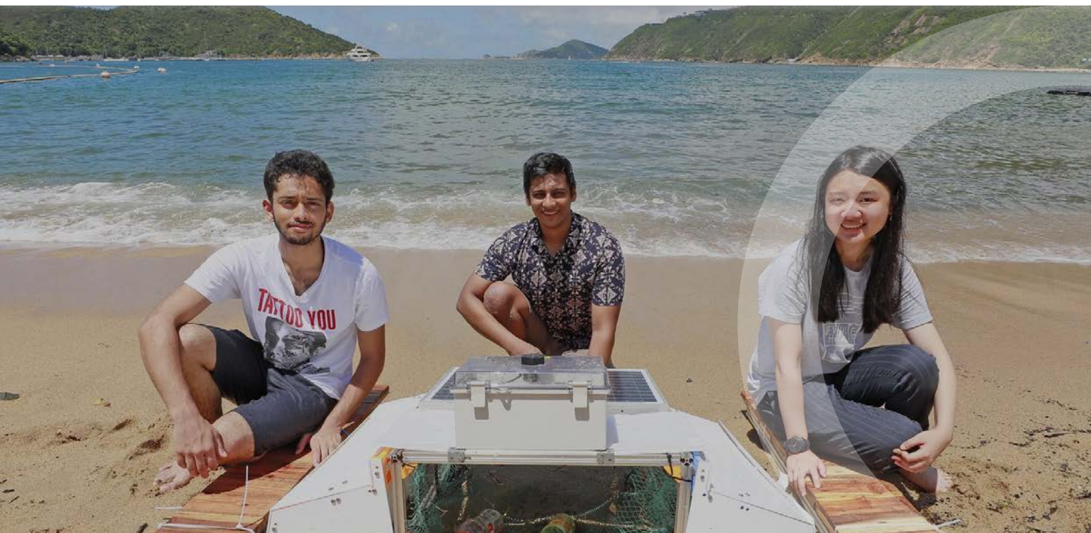
The Clearbot team with an early prototype of their innovation. Since the Plastics Data Challenge, the company has tied up with consumer electronics company, Razer, to redesign their AI-powered ocean cleaning robot.