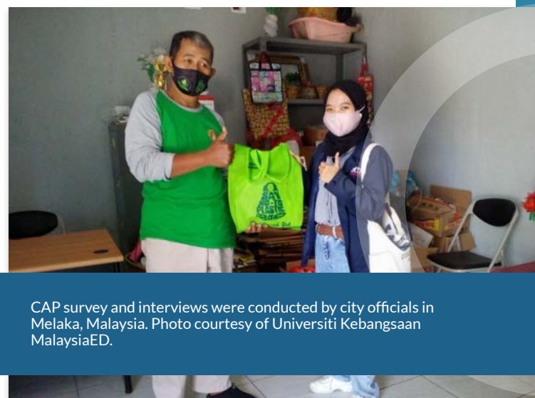
CAP survey and interviews were conducted by city officials in Melaka, Malaysia. Photo courtesy of Universiti Kebangsaan MalaysiaED.

The demand for this type of support is increasing, with nearly 25% of cities in the Resilient Cities Network having identified waste management as their core priority for building urban resilience. In less than 12 months, Urban Ocean has connected more than 11 cities, eight local implementation partners, and more than 200 resilience practitioners to help scale this work globally.