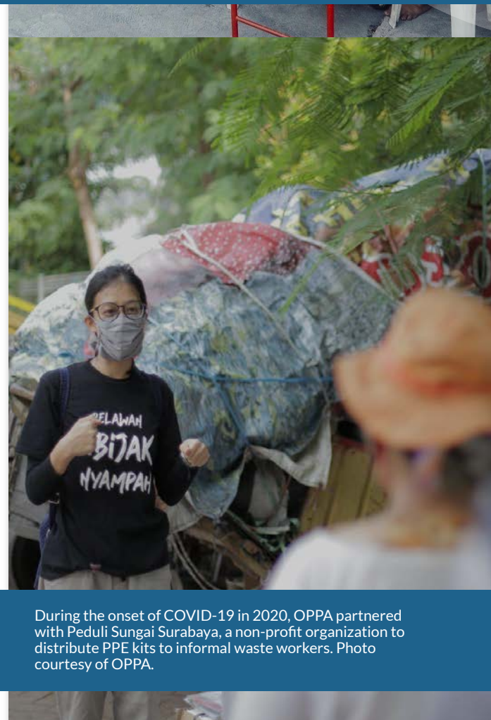
During the onset of COVID-19 in 2020, OPPA partnered with Peduli Sungai Surabaya, a non-profit organization to distribute PPE kits to informal waste workers.