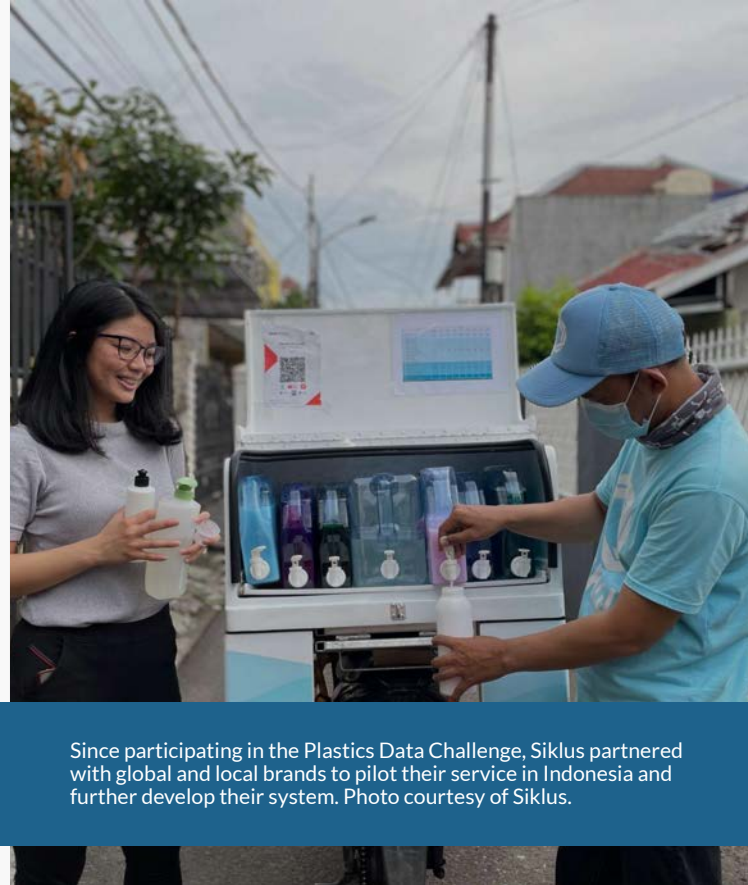
Since participating in the Plastics Data Challenge, Siklus partnered with global and local brands to pilot their service in Indonesia and further develop their system.

In June 2020, Clearbot , Kabadiwalla Connect , and Siklus were named as Challenge Finalists. Since completing the Challenge, each company has advanced in further developing their products or services, piloting their models with key value chain partners and securing additional resources to help them scale.